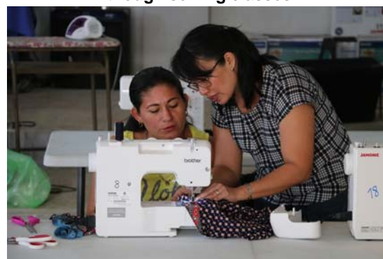
ECO "Global Engagment" Pre-Conference