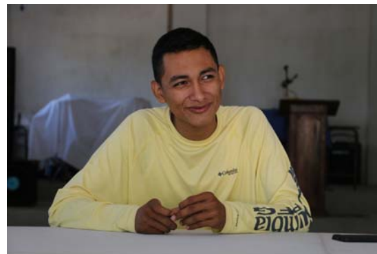
Stone Ministry: Mobilizing churches to engage in schools